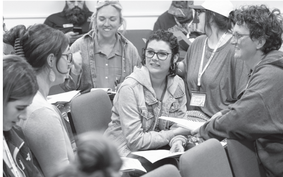
Above: For practice, attendees discuss a need they might encounter in children's ministry and how to best respond using trauma-informed practices. Left: The group lists behaviors a child might display that could signal to a children's ministry leader or volunteer that the child has been impacted by trauma.